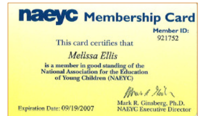
Sample Membership Card

Thank you for your interest in participating in this program. Please feel welcome to call (800) 727-3107 x18 with any questions.